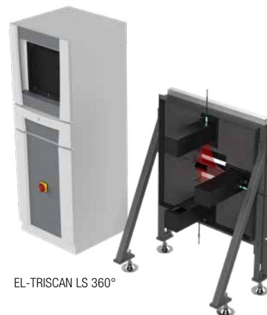
EL-TRISCAN LS 360°