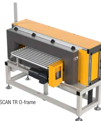
EL-TRISCAN TR O-frame

The traversing O-frame (NRS50) and C-frame (NRS60) systems offer precise profile acquisition using laser triangulation, chromatic-confocal, or interferometric sensors.